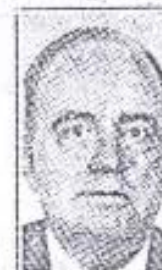
Robert LaFollette Among the dead