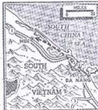
(NEWS Map by Staff AP/AG) Map locates plane crash.

On leave from Ball State, he returned to Germany to serve as education adviser to the U.S.