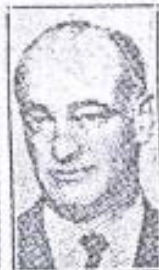
Vincent F. Conroy Victims of plane crash