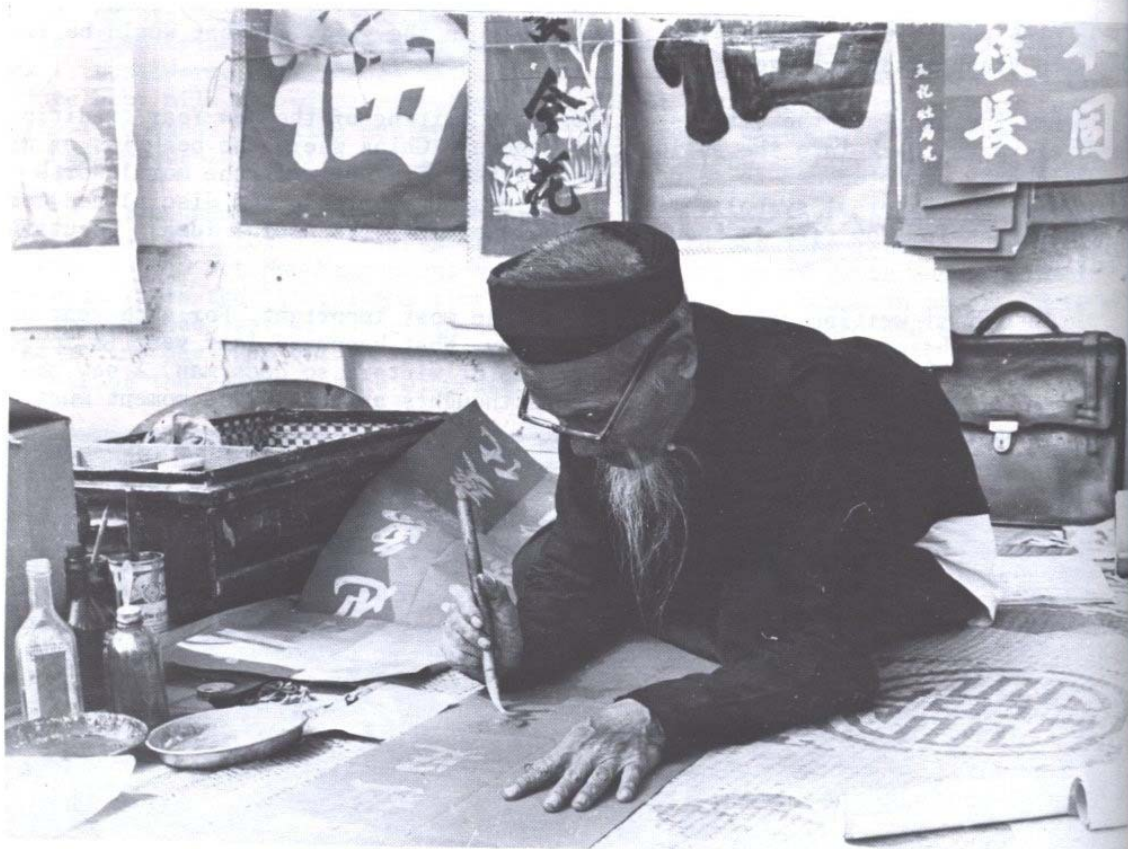
A Vietnamese scholar deeply engrossed in the thoughts of writing wishes for the New Year.