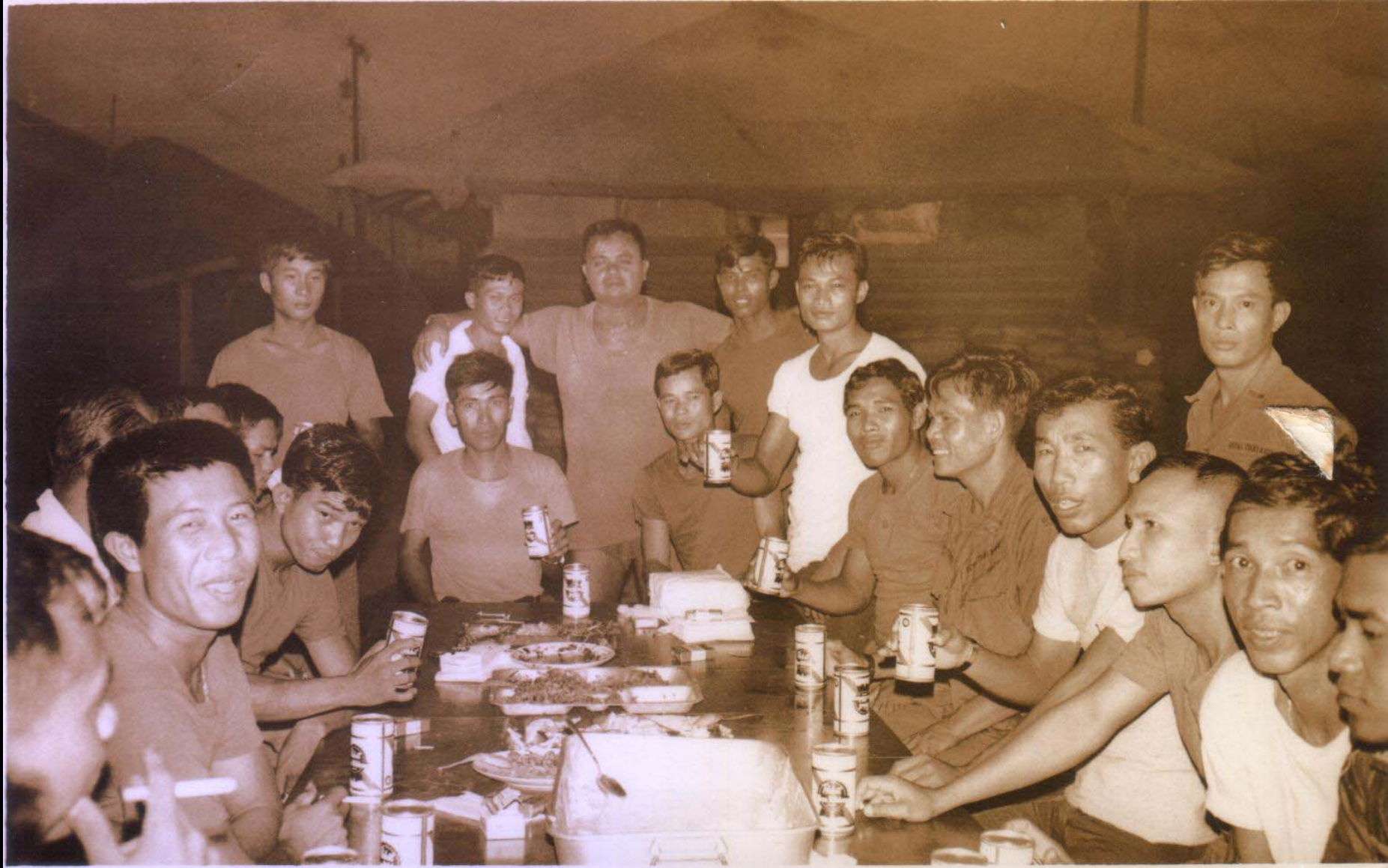
Members of the Black Panther division's transportation unit toast each other with cans of Pabst Blue Ribbon Beer in Bearcat Camp in 1970