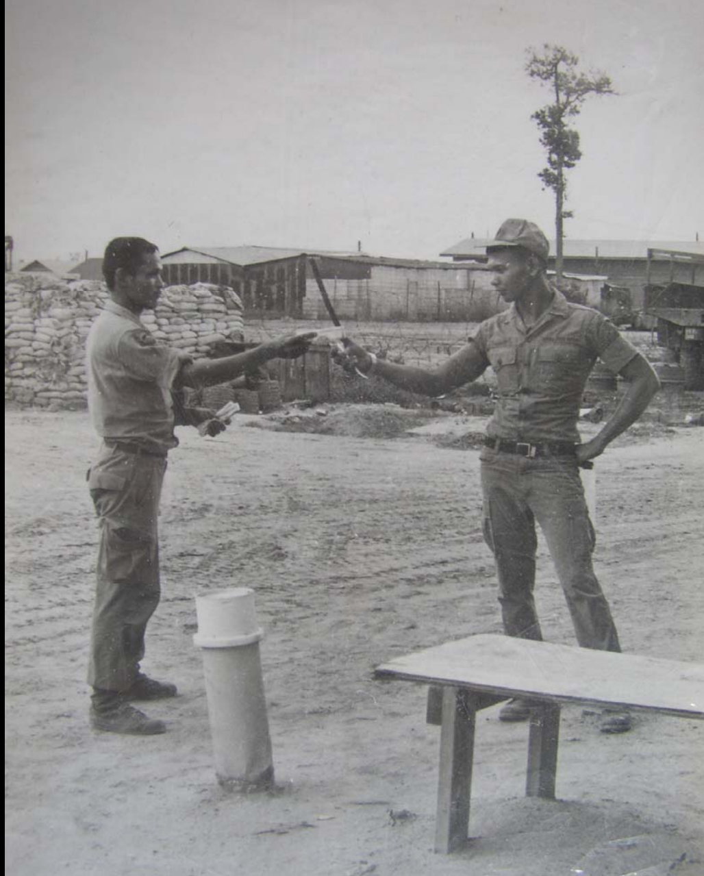
Two Thai soldiers displaying money in Bearcat Camp, 1970