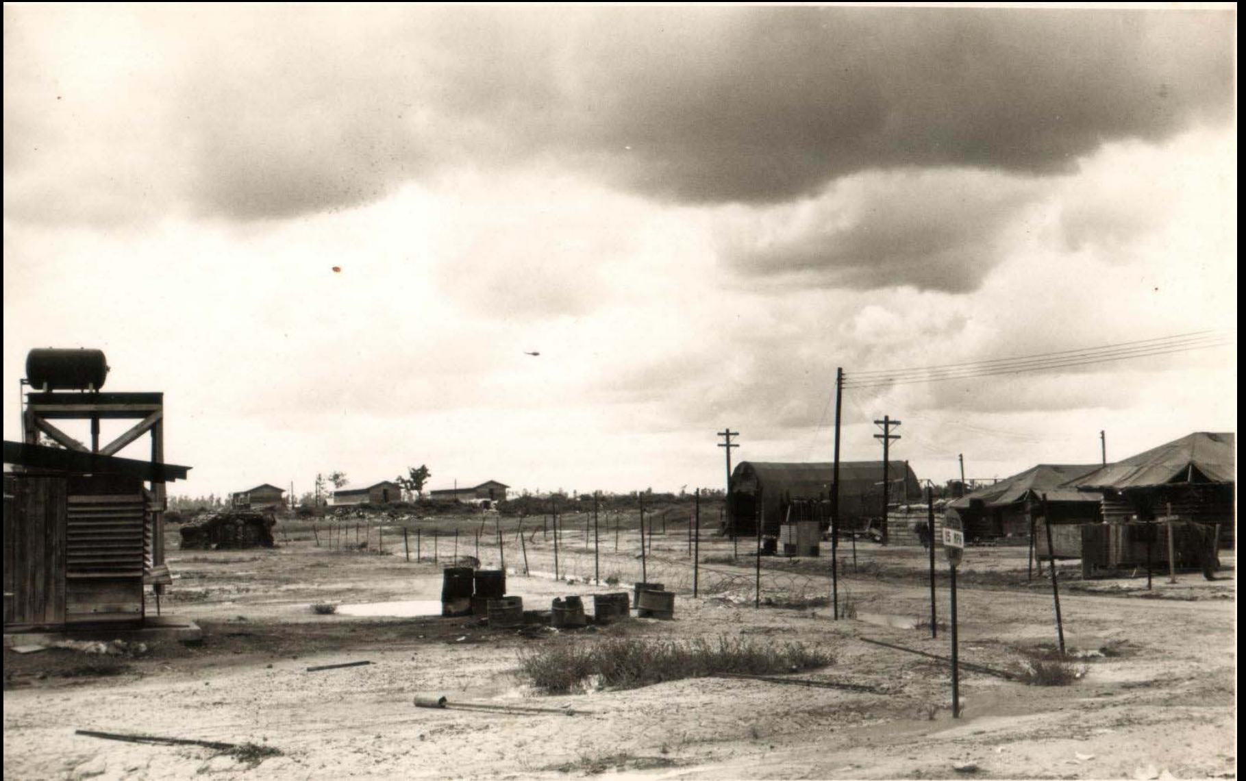
Bearcat Camp, Bien Hoa province, South Vietnam