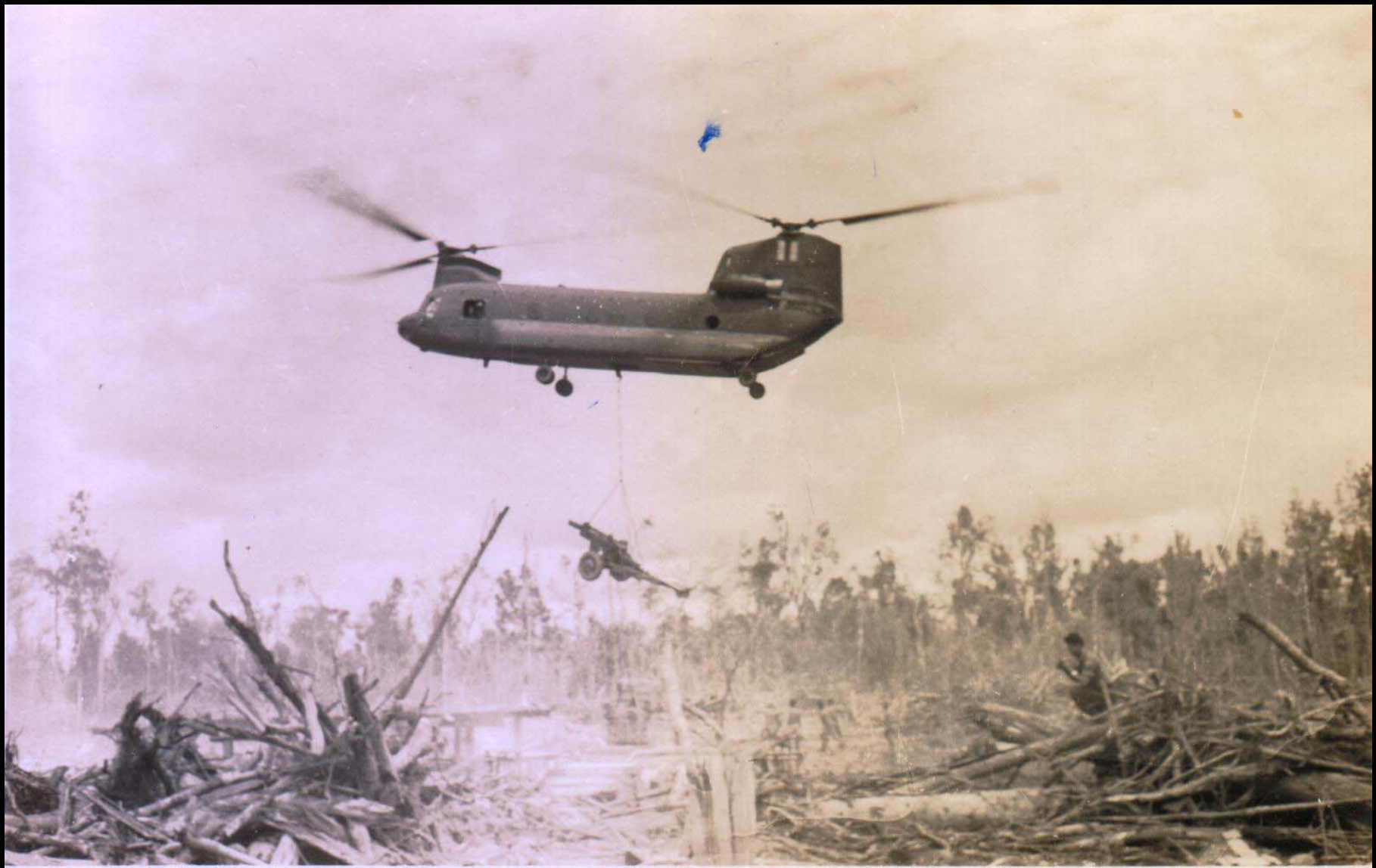
U.S. Army CH-47 cargo helicopter moving Thai artillery in Long Thanh district