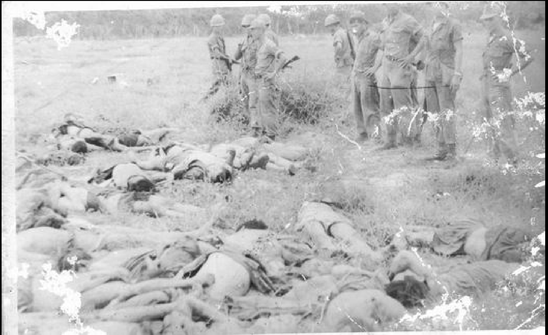
Thai soldiers gather Viet Cong corpses following a battle