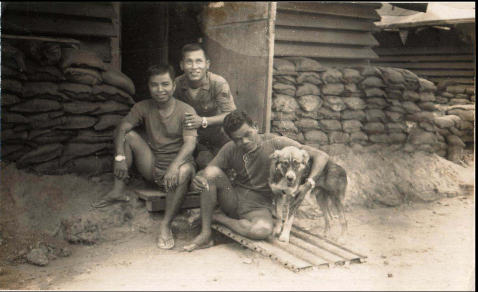
Members of the Black Panther division in Bearcat Camp, 1970