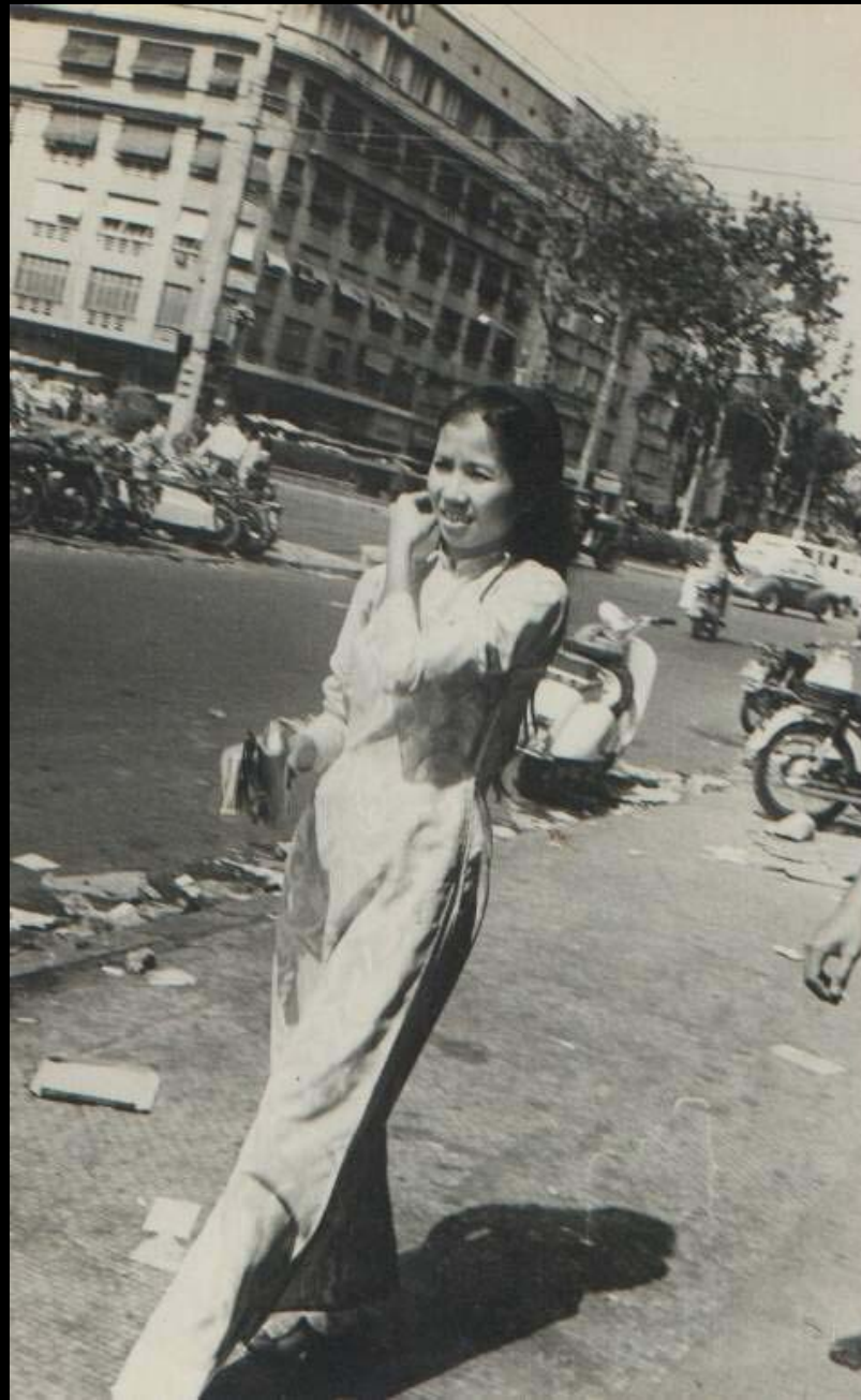
Vietnamese woman walking in Saigon, 1969