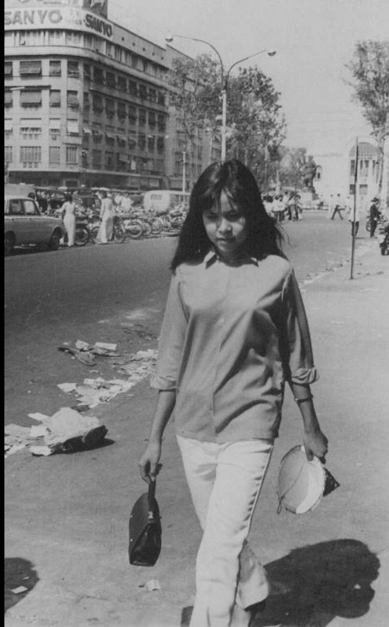
Vietnamese woman walking in Saigon, 1969