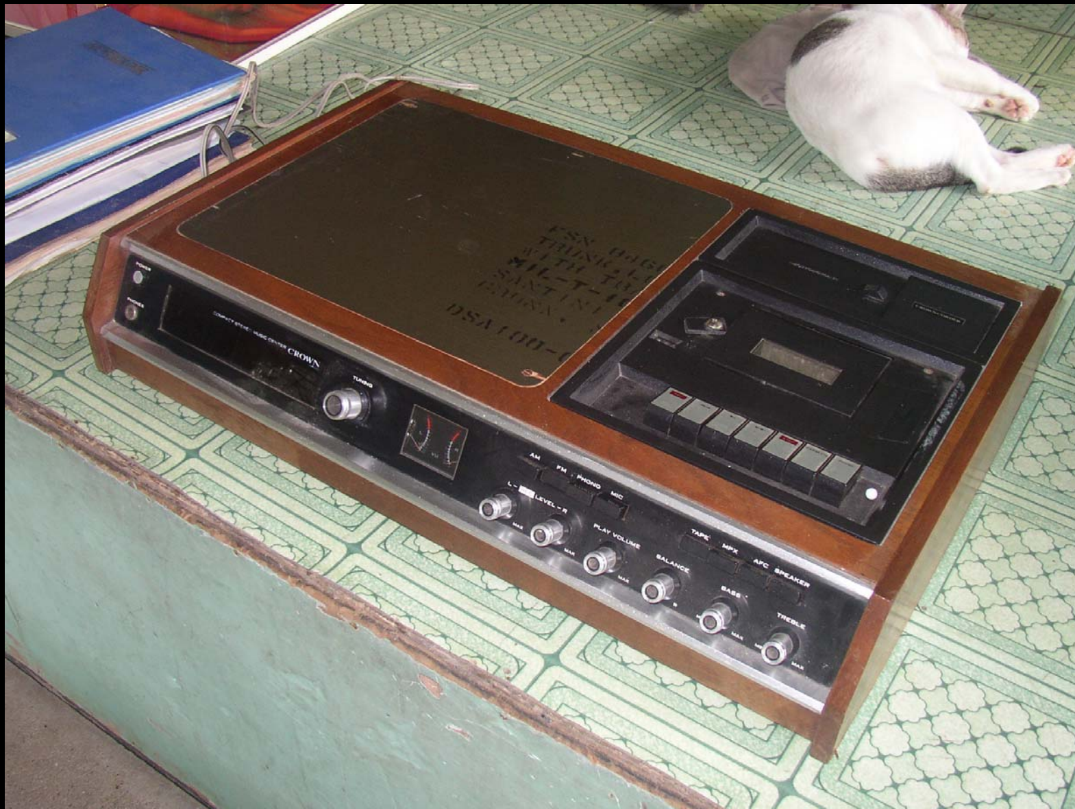
Lung Thom's Crown hi-fi stereo