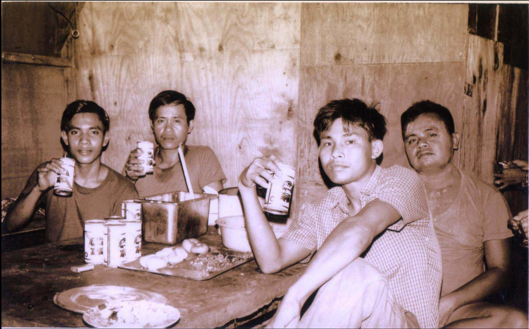
Members of the Black Panther division's transportation unit relaxing after dinner with cans of Pabst Blue Ribbon beer in 1970